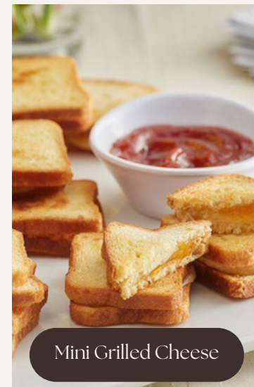
Mini Grilled Cheese