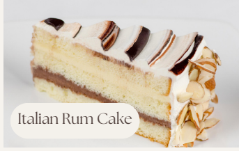
Italian Rum Cake